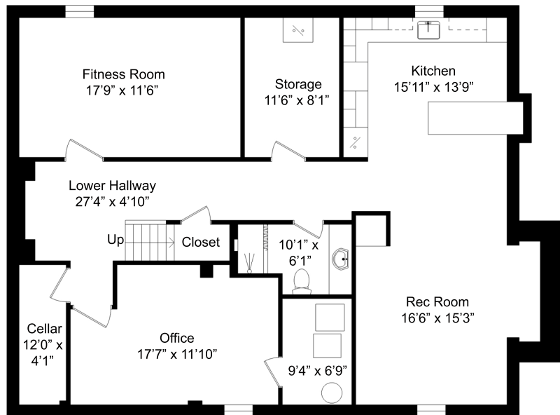
LOWER LEVEL (1602 SQ.FT.)